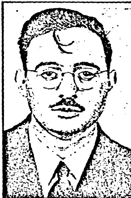
JULIUS ROSENBERG Knock and then enter.